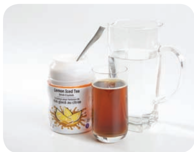
Figure 1 This iced tea was made by dissolving iced tea powder in water.

dissolve: to mix one type of matter into another type of matter to form a solution