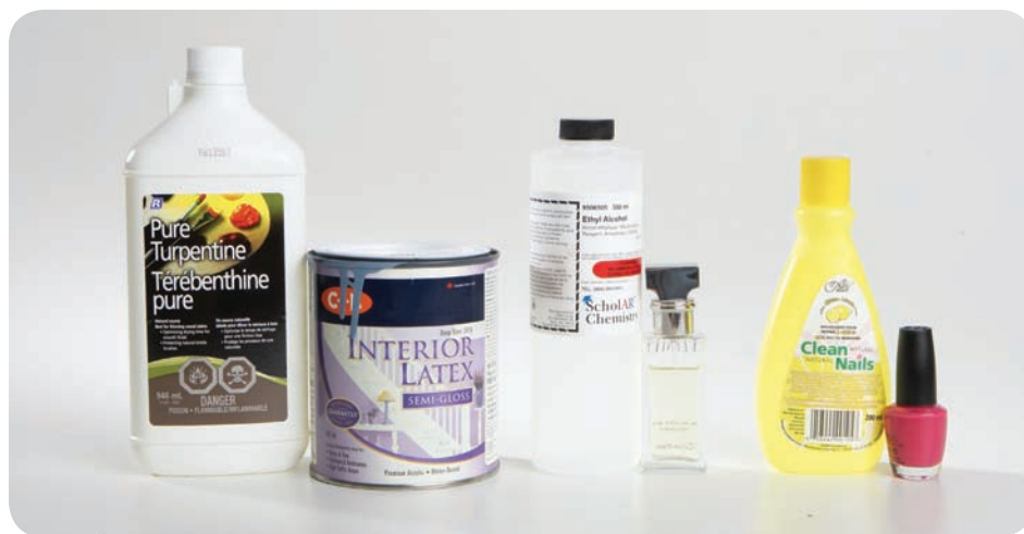
Figure 2 Ethanol, turpentine, and ethyl acetate are useful solvents for matter that does not dissolve in water.

Other solvents, besides water, are also useful. Ethanol is the solvent in perfume. Turpentine is a solvent that is used with paints. Ethyl acetate is one of the solvents in nail polish (Figure 2).