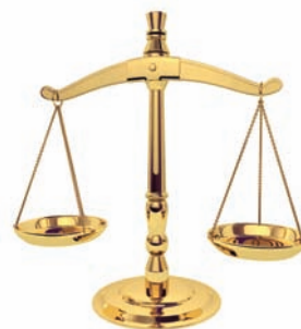
Figure 6 Brass is an alloy (a solid solution) of copper and zinc.