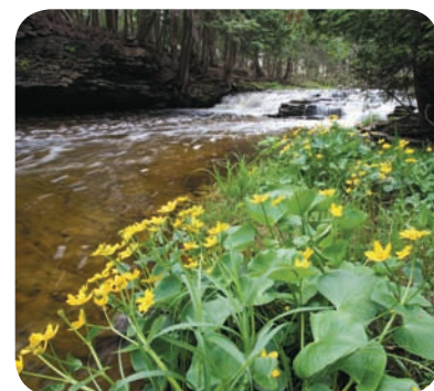
Figure 4 Plants absorb the minerals and nutrients dissolved in water through their roots.