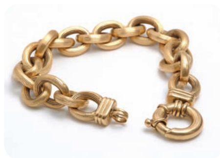
Figure 5 Yellow gold is a solid solution of solutes (silver and copper) in a solvent (gold).

Solid solutions are called “alloys” when they contain two or more metals. To make alloys, the metals are heated until they melt, and then they are mixed together and allowed to cool. Brass is an alloy of copper and zinc (Figure 6). Bronze is an alloy of copper and tin. In both brass and bronze, copper is the solvent. What are the solutes?