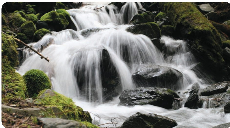
Figure 3 As water flows in a stream, it dissolves many substances.

The water from your tap probably looks and tastes like pure water. Tap water is a solution that contains many solutes. These solutes include iron, aluminum, salt, fluorine, calcium, magnesium, and chlorine. How did they get into your tap water? As water flows in rivers and lakes and underground, it comes into contact with many types of matter (Figure 3). Gases from the air and minerals from the rocks and soil dissolve in the water. Pollutants may also dissolve in the water.